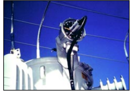
Model 1265 Installed at Site